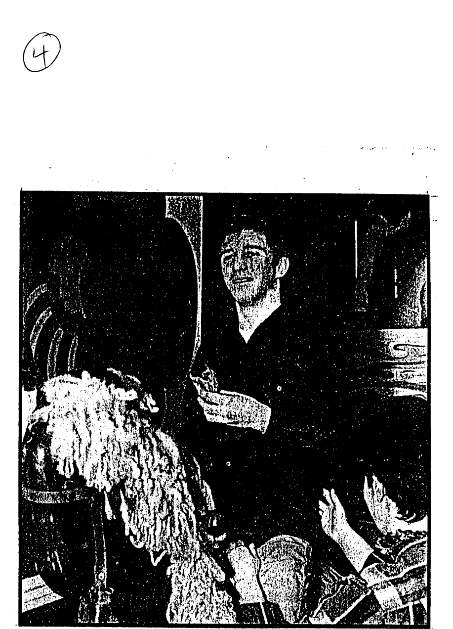
Rewarded with a ride