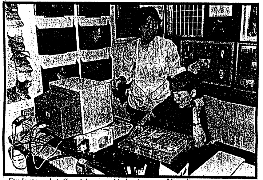
Students and staffers (above and below): most of Israel's charges failed in other programs.

maintained that the boy's shackling did not violate BRI's restraint waiver, evidence that the state's restrictions on Israel were vague.